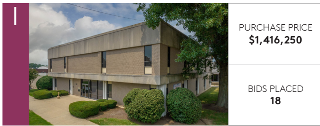
629 Wabash Ave New Philadelphia, OH