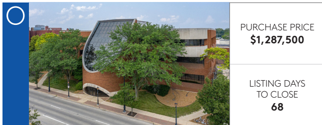
One Copley Plaza Springfield, IL