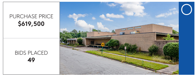
300 South Beech Street Pine Bluff, AR